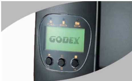
Updated Graphic LCD