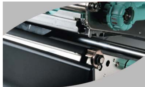
Adjustable sensor kit