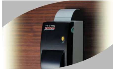
Wall Mount Feature