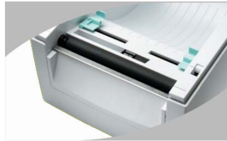
Easy to Maintain